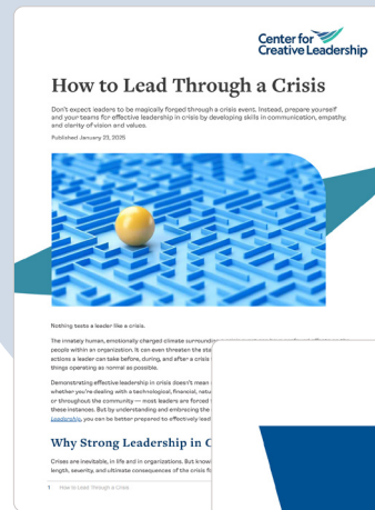
"How to Lead Through a Crisis"

Based in decades of research and real-world application, this program gives your leaders the tools they need to lead with confidence through the crisis in front of them.