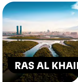
RAS AL KHAIMARH